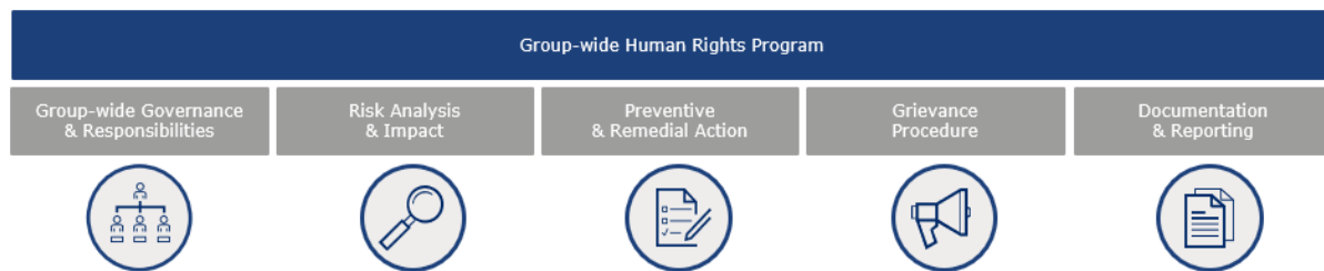
Graphic 1: The five building blocks of our Human Rights Program

Our human rights due diligence – for our own operations and supply chains – is based on five building blocks: